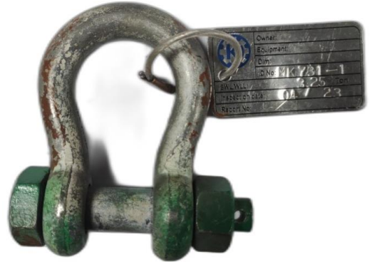
Shackle 3.25T #1 MK73-1